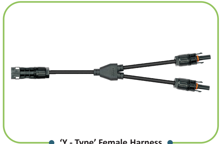
'Y - Type' Female Harness